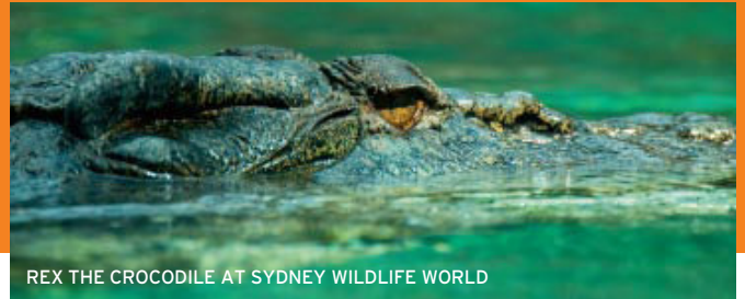
REX THE CROCODILE AT SYDNEY WILDLIFE WORLD