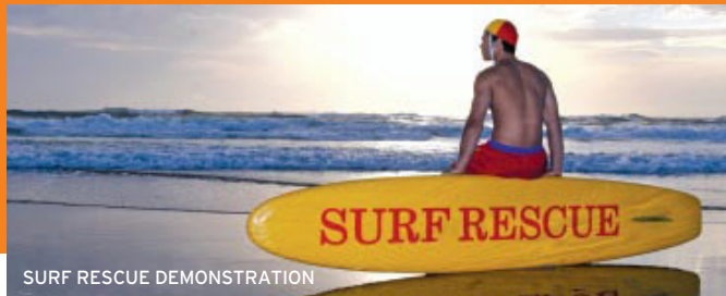
SURF RESCUE DEMONSTRATION