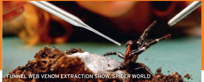
FUNNEL WEB VENOM EXTRACTION SHOW, SPIDER WORLD